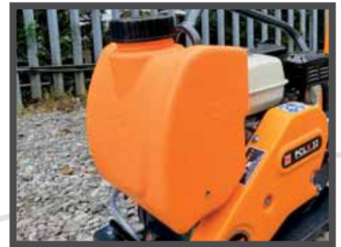
OPTIONAL 12 LTR QUICK-RELEASE WATER TANK