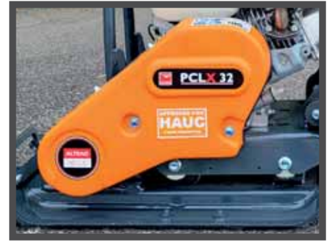
8HRS+ SAFE MACHINE